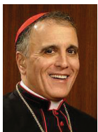
Cardinal Daniel DiNardo Archbishop of Galveston-Houston

Speaker Series — Regnum Christi Houston collaborates with the Lumen Institute to bring in highly respected speakers in the areas of business and culture. From these recognized influencers, members can learn a great deal about the qualities inherent to good leadership. Recent speakers include the following: